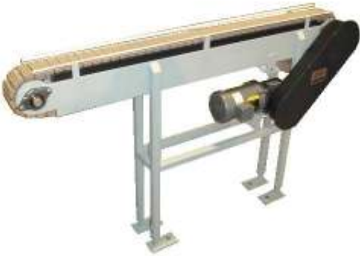
Plastic Chain Conveyor