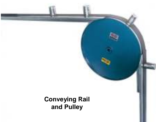
Conveying Rail and Pulley