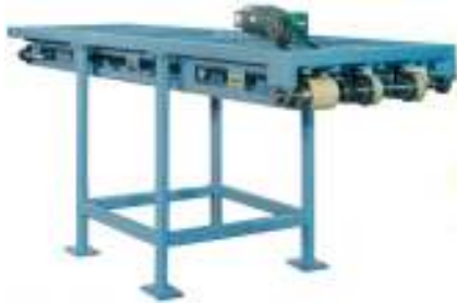
Overhead / Inverted Conveying Systems