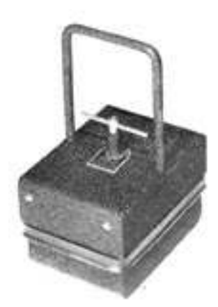
Model 74 Multi lift