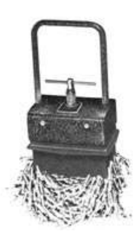
Model 72 Multi lift