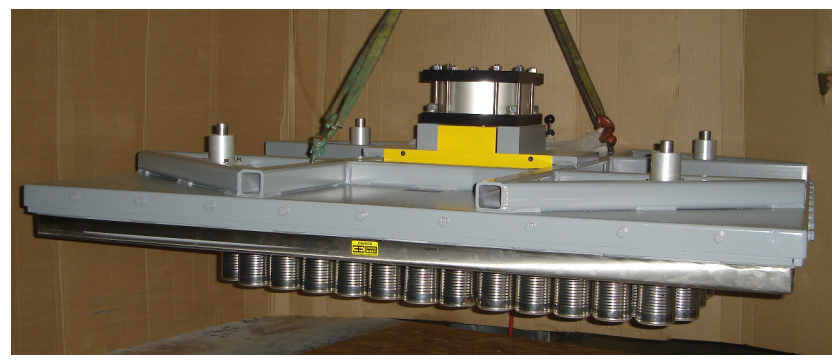
Holding Full Cans

Magnetic Palletizing/Depalletizing Heads are an excellent solution for lifting and moving empty or full steel cans, aerosol cans, jars with steel metal lids, and more. Palletize or de-palletize easily by retracting the internal permanent magnets using pneumatically or hydraulically operated cylinders.