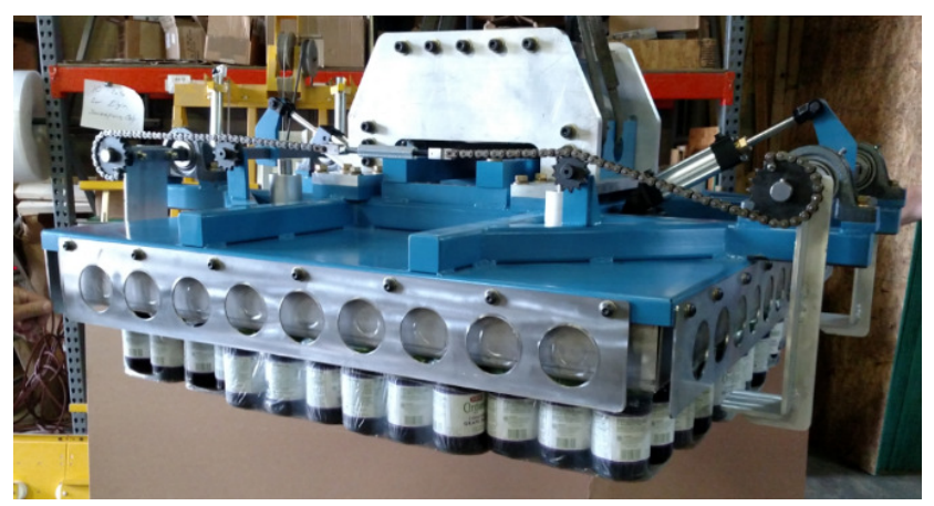
Holding Full Glass Jars with steel lids

If you have any current applications or require additional assistance, please contact us at: 248-628-3808 or Toll Free at 1-800-787-3624 and we will be more than happy to assist you.