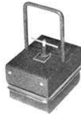
Model 74 Multi lift