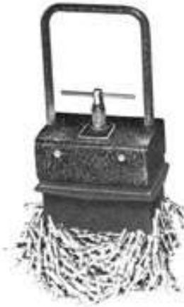
Model 72 Multi lift